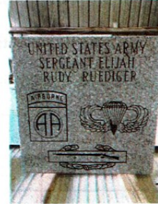
Grey Paver (check here, if applicable)