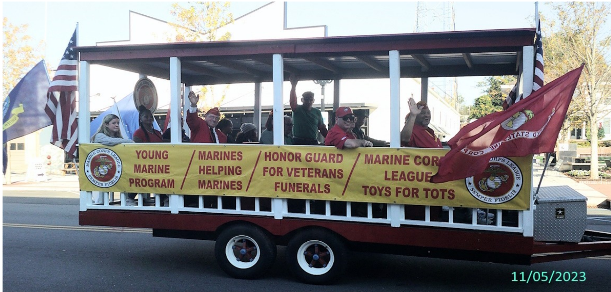
ANDERSON COUNTY VETERANS DAY PARADE