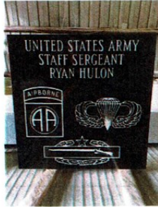
Black Paver (check here, if applicable)

Grey Pavers are intended to honor Veterans who honorably served in the United States Military, regardless of their home of record upon entry into Military Service.